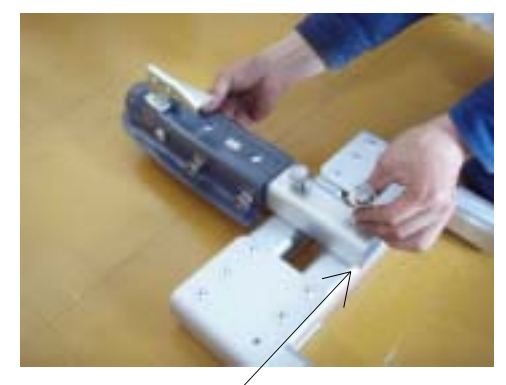
The pipe end is just size.