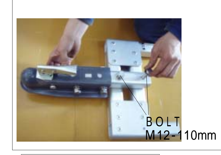
< Caution ! > Not for hi speed use. Less than 5km